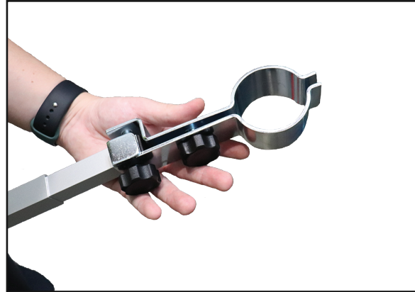
Step 2 : Attach the connector to the post and screw the back screw in place and repeat on other side.