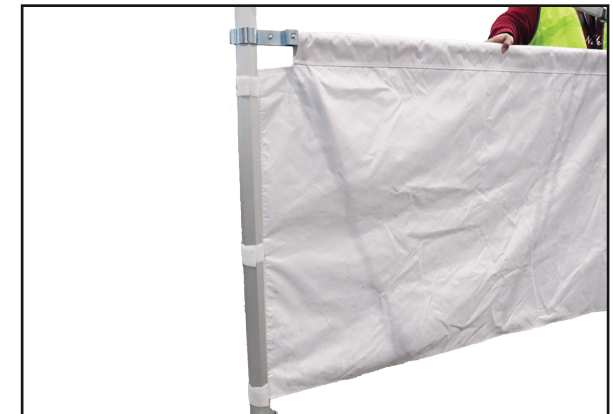
Step 6 : Attach the velcro straps to the legs of the frame.