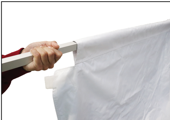
Step 4 : Extend the pole and slide the fabric onto the pole. Ensure the print faces the right way.