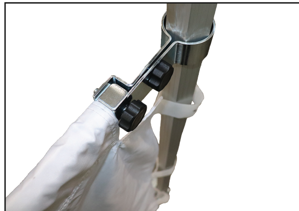
Step 5 : Place the second end of the pole into the second connector and screw it into place.