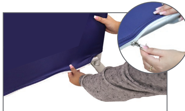
Step 5: Finally, pull the banner down tightly. This step is much easier with some assistance. So ask a friend if they can connect the zipper and begin closing the zipper, while you maintain tension on the banner.