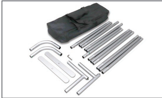
Step 1: Unpack all the contents of the carry bag.