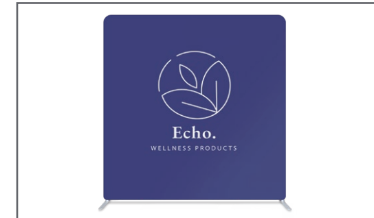
Step 6: You should now have a great looking Stretch Fabric Media Wall!