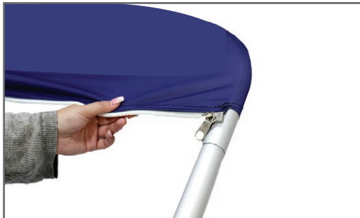
Step 4: Unzip the bottom of your banner and begin feeding the banner over the pole set. Start in one corner and then move onto the next corner. Then evenly pull the entire banner to the bottom of the pole set.