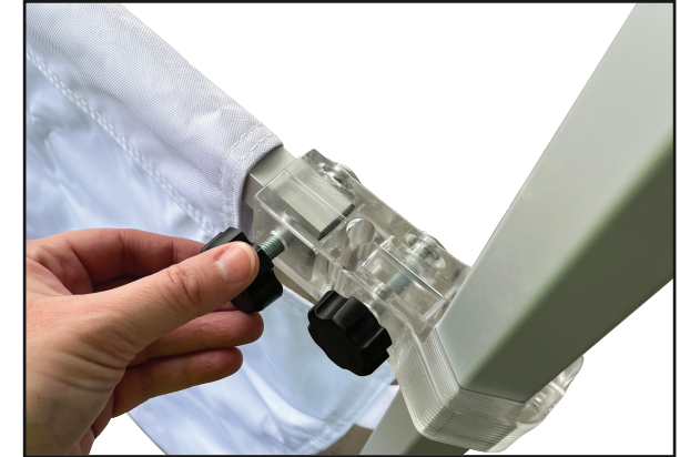
Step 3 : Place the end of the pole into the first connector, screw the pole in place