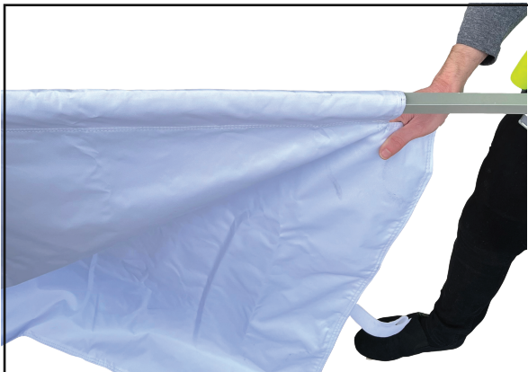
Step 4 : Extend the pole and slide the fabric onto the pole. Ensure the print faces the right way.