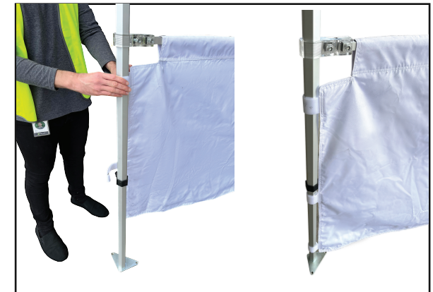
Step 6 : Attach the velcro straps to the legs of the frame.